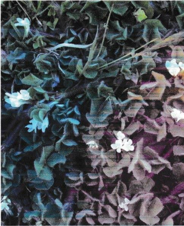
* Trifolium subterraneum – Subterranean Clover Prostrate exotic annual tri L: 3, folium L: leaf, sub- L: under, terra L: earth Native of Europe, Mediterranean region ☼